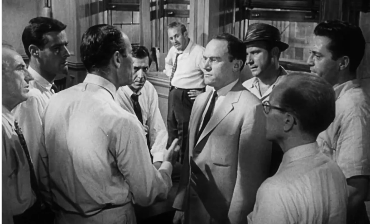
Screenshot of the courtroom drama Twelve Angry Men (1957)